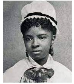
Dr. Rebecca Lee Crumpler